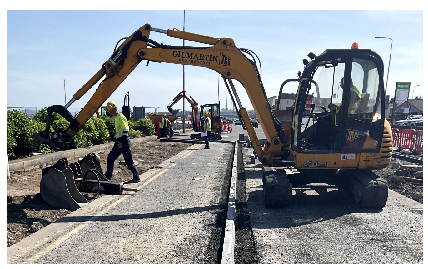
The photograph pictured at Kirkcaldy Waterfront is part of the scheme we are delivering on behalf of Fife Council